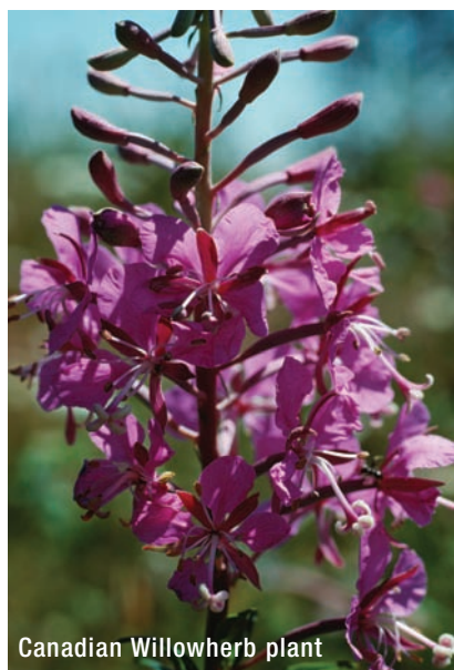
Canadian Willowherb plant