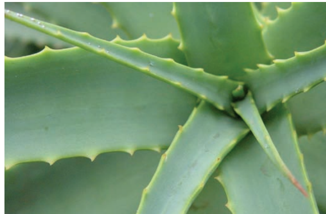
Aloe and added vitamins help Soothe & Cool soothe and condition skin.