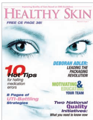
Healthy Skin Magazine

great resource for long-term care professionals responsible for quality of care, CMS compliance, and survey readiness. Full of helpful articles and tools you can use, and free to you and your staff.