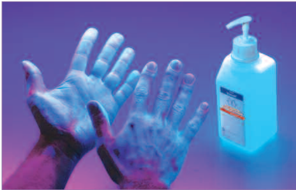
Unprotected or insufficiently protected areas of the hands will appear darker in color.