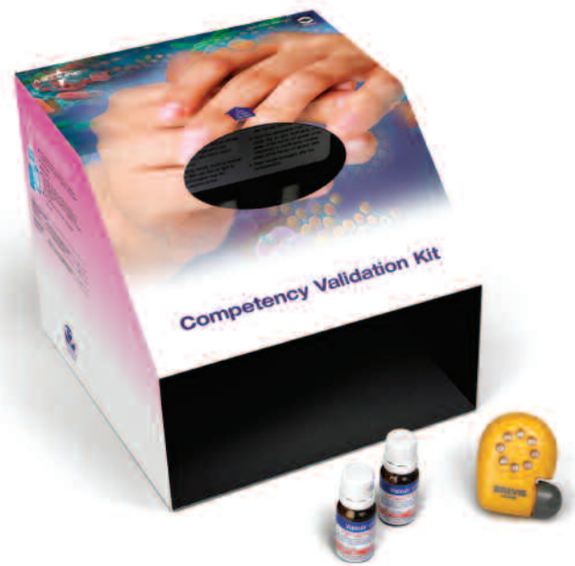
Kit includes: 1 validation box, 1 UV light, 2 bottles of Visirub tracer solution & 2 labels