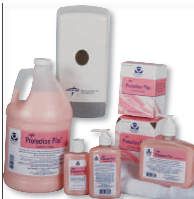
Protection Plus Enriched Lotion Soap Family