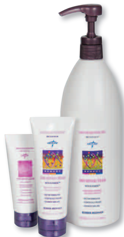
Remedy Skin Repair Cream