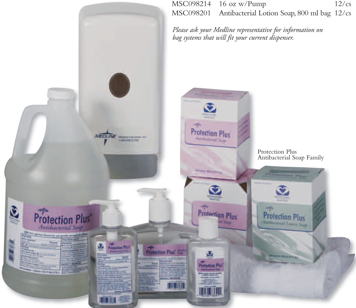
Protection Plus Antibacterial Soap Family

Please ask your Medline representative for information on bag systems that will fit your current dispenser.