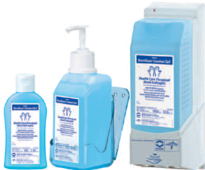
Sterillium Comfort Gel family of product