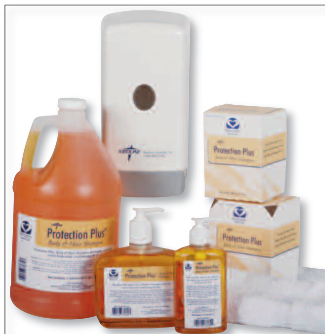
Protection Plus Shampoo and Body Wash Family