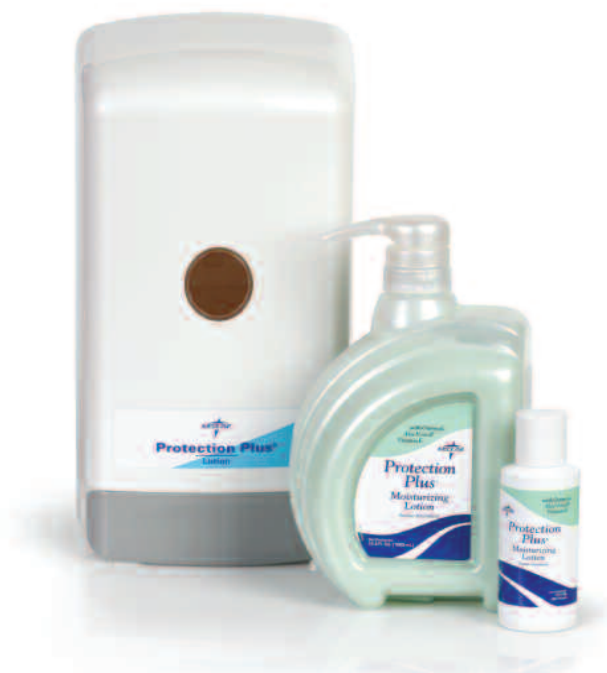
Protection Plus Lotion Family