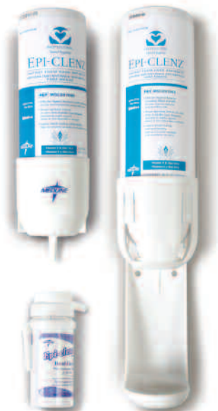
MSC097040 & MSC097045, MSC097041, MSC097032 & MSC097046