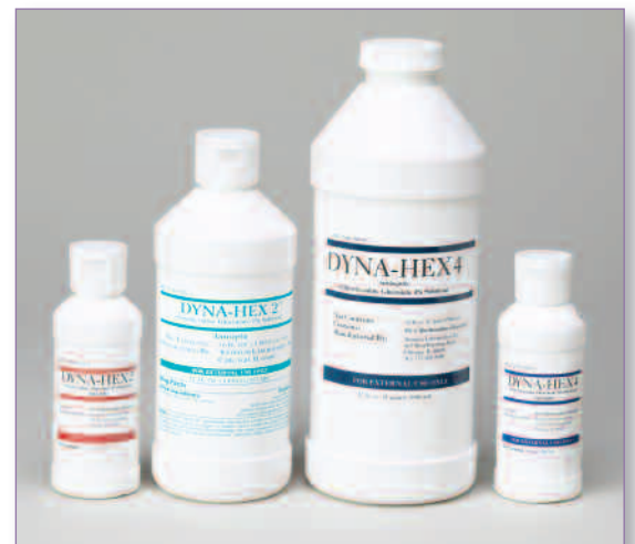
CHG family of product