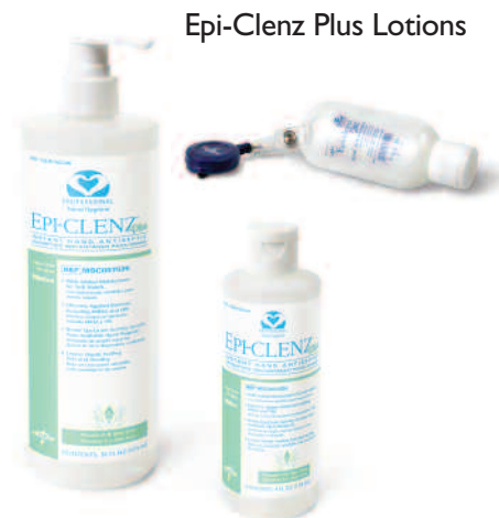
MSC097026, MSC097024, MSC097025