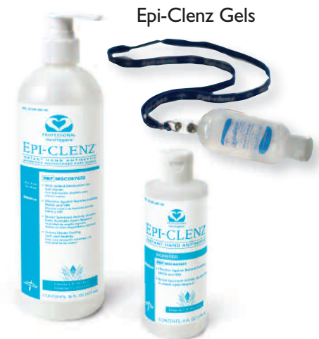
MSC097032, MSC097030 MSC097034N & MSC097034L