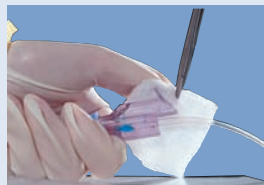
Medline's Contro-Vac valve

valve has been proven to be more effective than chimney valves at preventing contact with fluids.