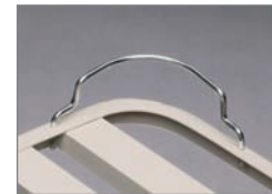
Mattress stays at each corner to prevent slippage