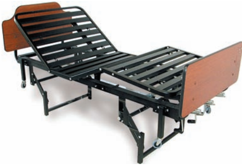
MDR1022B with MDR1022RHF