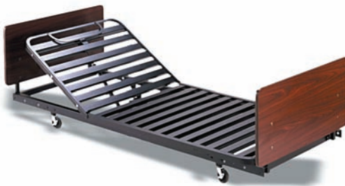
MDR1012B with MDR1012RHF